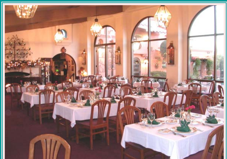
The Main Dining Room