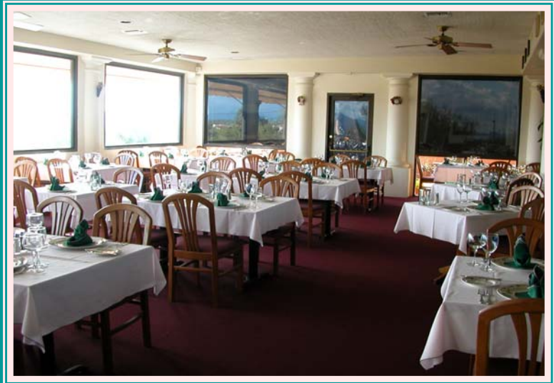
The Wine Cellar