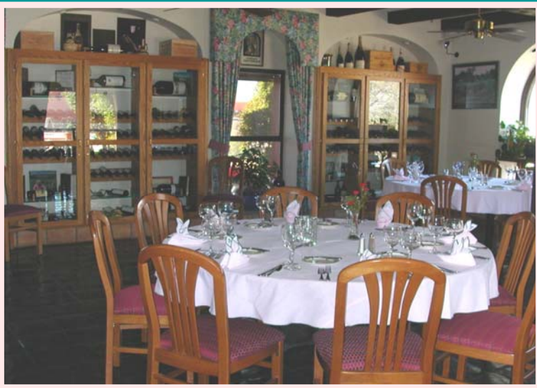
The Wine Library

Choose the room that best fits the size of your party and creates the atmosphere you desire. Or if you prefer, don't just stay in one place. Begin your evening with cocktails in the Outdoor Courtyard facing the Catalina Mountains or on our Front Patio Terrace overlooking the sunset and city lights.