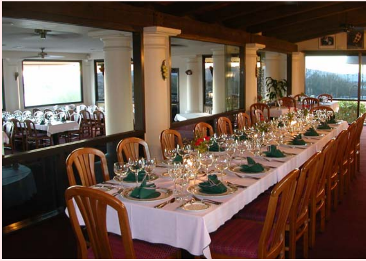
The Patio Room